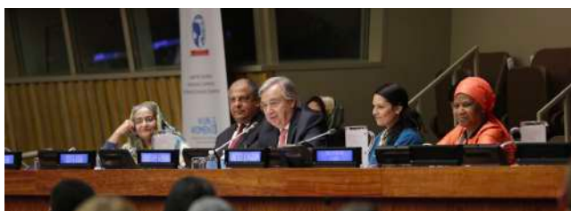
Secretary General Antonio Guterres speaks on a panel about the flagship programme 'Making Every Woman and Girl Count' at GA72.

In March 2018, the then International Development Secretary and Minister for Women and Equalities Penny Mordaunt announced a contribution of up to £6 million over four years for the UN Women-led flagship programme for gender data. This programme, named ' Making Every Woman and Girl Count ,' seeks to address the urgent need to increase the availability of accurate information on gender equality and women's rights in order to inform policy and decision-making. The public-private initiative was established in 2016 and will continue over the course of five years.