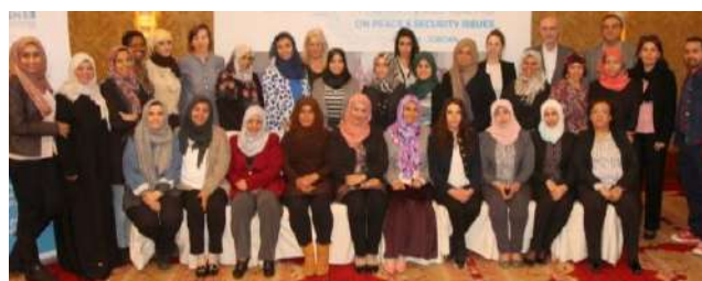
Consultation Meeting on Political Progress Post-Peace Agreement, Amman, March 2017

Women's Political Participation within Yemen's Peace Process and Transition . This GBP 0.8 million UK-funded programme ran from August 2016 to July 2018 and engaged more than 500 Yemeni women leaders in the peace and reconciliation process in the country.