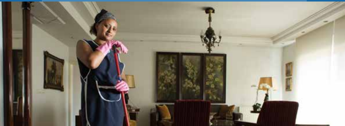
A domestic worker who migrated from Ethiopia is employed in Beirut, Lebanon.

FACILITATING MIGRANT DOMESTIC WORKERS' REINTEGRATION IN THEIR HOME COUNTRIES