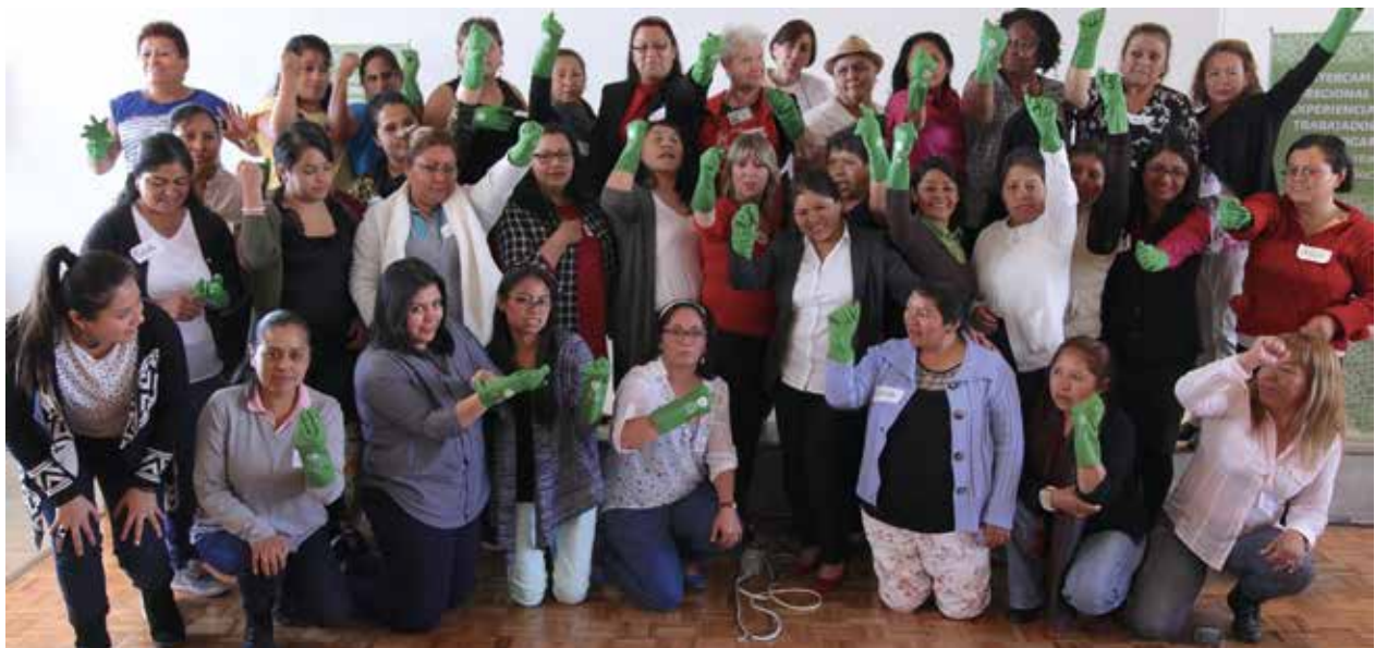
Members of the Mexican National Union of Domestic Workers (SINACTRAHO) with Latin American domestic workers leaders at a regional meeting on exchanges of experiences in Mexico City.

The hidden yet widespread nature of domestic work calls for stronger data collection and public awareness on its realities. The isolation it imposes requires collective structures. Socioeconomic vulnerabilities among these workers and their exposure to risks demand strong legislation, effective service provision and wide-spread information. This section presents some of the different strategies and good practices used by grantee organizations across the globe to support domestic workers' rights.