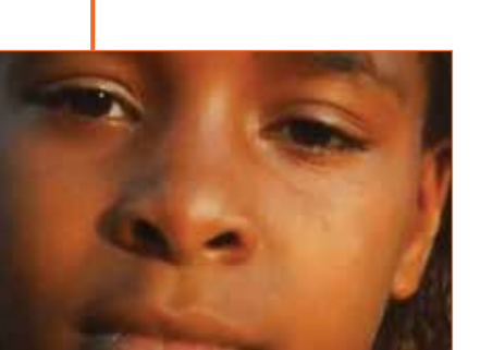
WANT TO LEARN MORE?

Want to learn more? Watch Raising Voices films at http:// raisingvoices.org/ resources/#film