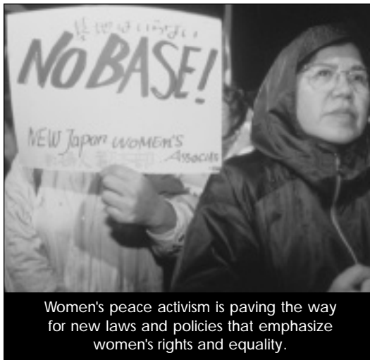
Women's peace activism is paving the way for new laws and policies that emphasize women's rights and equality.

Since women's peace activism has been largely confined to grassroots and civic organizing, women often face an uphill struggle to reach official political