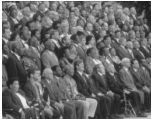
The adoption of positive action programmes in the new South Africa is widening the space for women to participate in charting the country's development.

Reflecting on events in Northern Ireland, Mo Mowlam suggests that through their decade of cross-community work, women there created space for moderation and compromise. "Attitudes, the hardest things to change in politics, slowly began to change," she says. In 1998, the Good Friday Agreement, which is the basis of the current peace process, was submitted for a public referendum. An