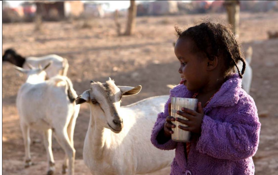
QARDHO, PUNTLAND Milk from surviving goats is helping displaced pastoralist families feed themselves.