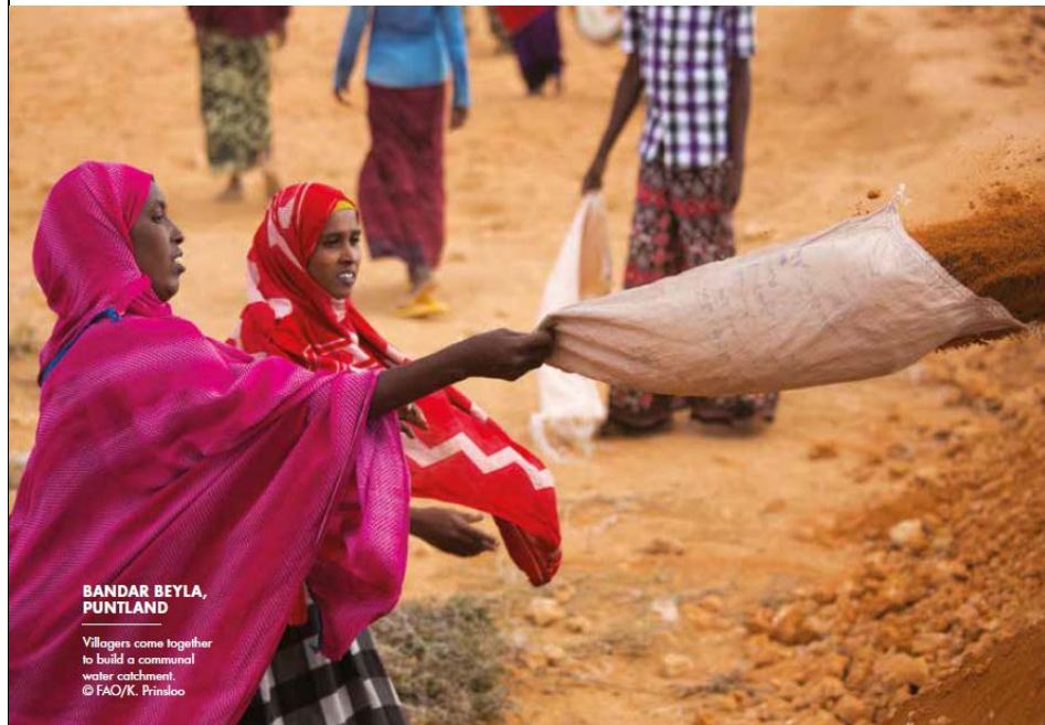
BANDAR BEYLA, PUNTLAND Villagers come together to build a communal water catchment.