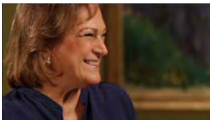
Turkish Mogul defies man's world

Women are increasingly providing the skills that emerging market companies need to compete on a global stage. Like the U.S., Brazil, Russia, China and South Africa have more women than men in professional and technical positions such as teaching, medicine and finance. Even higher up the career ladder, in most major emerging markets, with the exception of China, women hold now more than a third of managerial roles.