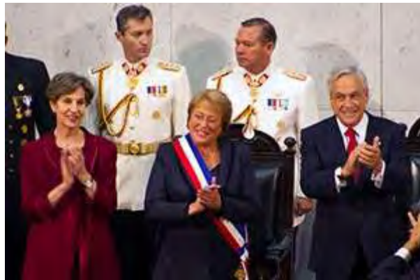
Ms. Michelle Bachelet is inaugurated on 11 March 2014 as Chilean President for the second time.

UN Women congratulates Ms. Michelle Bachelet on her inauguration as President of Chile on 11 March 2014 at a ceremony held in the Chilean Congress in Valparaiso.