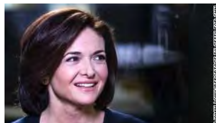
Best of leading women 2013