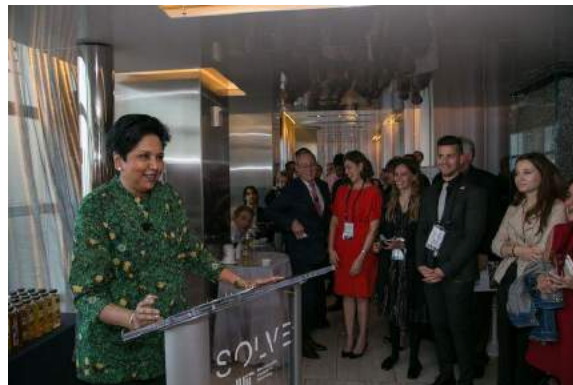
Indra Nooyi, Chairman and CEO of PepsiCo, speaks at Solve Challenge Finals as a Challenge

Chair for the Women and Technology pillar.