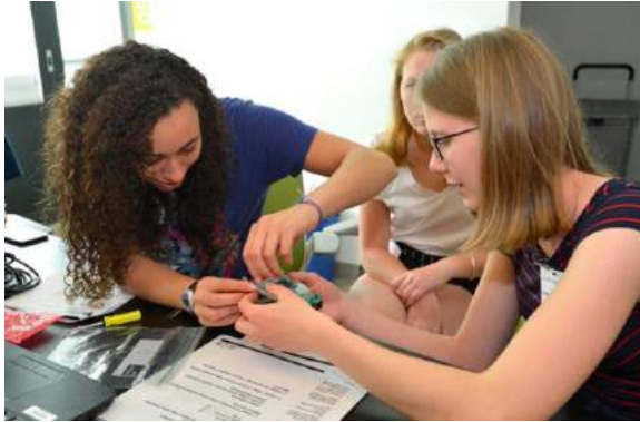
Girls Who Build addresses the gender gap in STEM through a series of creative and applied engineering curricula, offering girls access to valuable role models and content.

MIT's new Solve initiative just launched a Women and Technology Challenge asking for technology-fueled solutions that enable women and girls' full participation in the economy. MIT's new Solve initiative launched a Women and Technology Challenge, asking for technology-fueled solutions that enable women and girls' full participation in the economy. Solve brings together leading women like Ursula Burns, former Chairman of Xerox; Indra Nooyi, Chairman & CEO of PepsiCo; and Phumzile Mlambo-Ngcuka, Executive Director of UN Women, who all agree that fixing the gender gap goes through fixing the digital divide. Together with 13 other women leaders from MIT, Dubai Future Foundation, Alphabet, Forbes, and more, these women form the Leadership Group of Solve's Women and Technology Challenge.