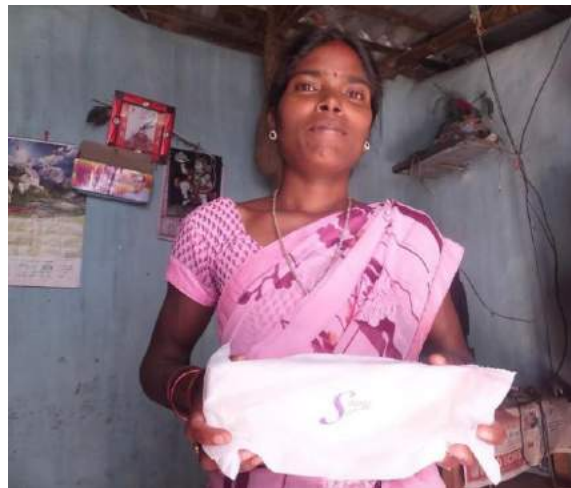
Saathi produces and distributes biodegradable sanitary pads to marginalized communities, confronting two issues simultaneously: lack of access to sanitary products and the environmental consequences of waste.

"We've reached a critical fork in the road to women's equality. As digital technologies become increasingly integrated into people's lives, they have the potential to create incredible opportunities for women and improve overall welfare and reduce poverty; but could also exacerbate inequality, especially if women have less access to and understanding of the technologies available. The gender gap is substantially linked to the digital divide - and MIT's Solve is convening leaders and innovators to chart the course for progress." - MIT Solve