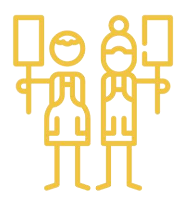
INVEST IN WOMEN'S ORGANISATIONS