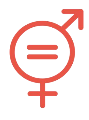
IMPLEMENT LAWS AND POLICIES